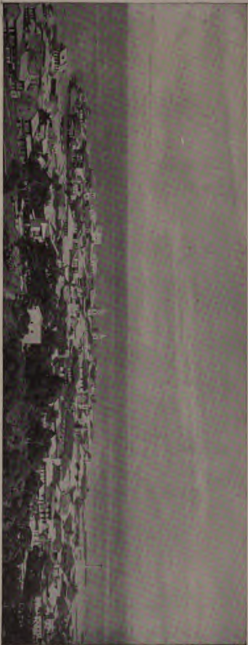
Panama City from Police Headquarters